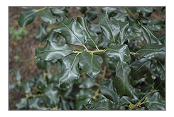
Dr. Huckleberry Holly foliage

Dr. Huckleberry Holly will grow to be about 30 feet tall at maturity, with a spread of 15 feet. It has a low canopy with a typical clearance of 2 feet from the ground, and should not be planted underneath power lines. It grows at a slow rate, and under ideal conditions can be expected to live for 50 years or more.