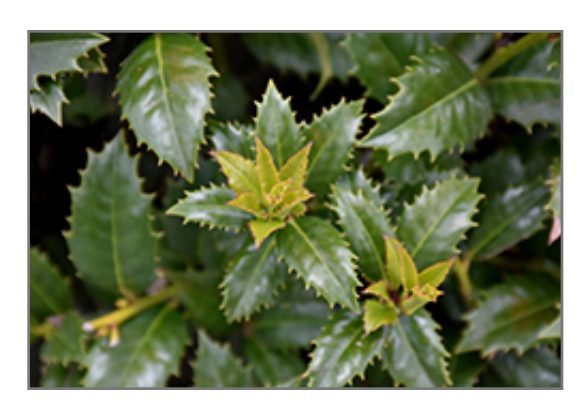
Mary Nell Holly foliage

Lustrous, oval leaves are light to dark green and slightly scalloped; brilliant red fruit throughout winter