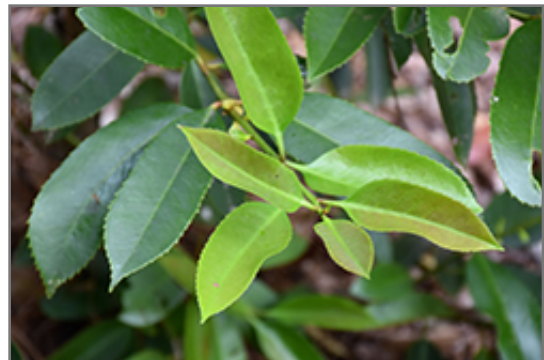
Lusterleaf Holly foliage