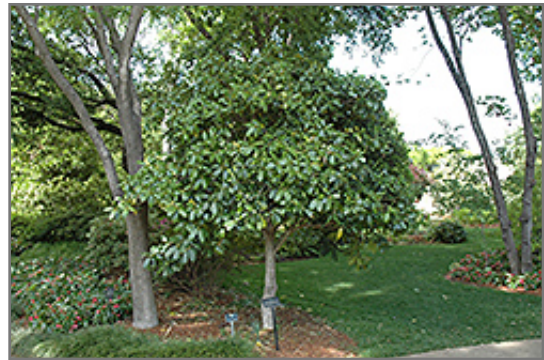
Lusterleaf Holly