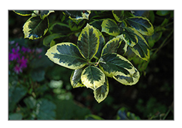
Golden King Holly foliage

A delightful ornamental plant with tidy, compact habit; splendid rich, dark green, glossy leaves with striking gold edges; nearly spineless and covered with red fruit in winter