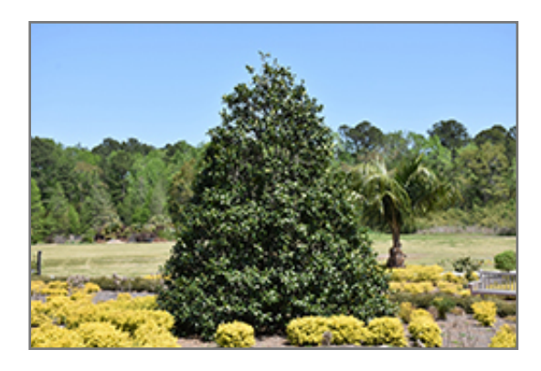
Emily Brunner Holly