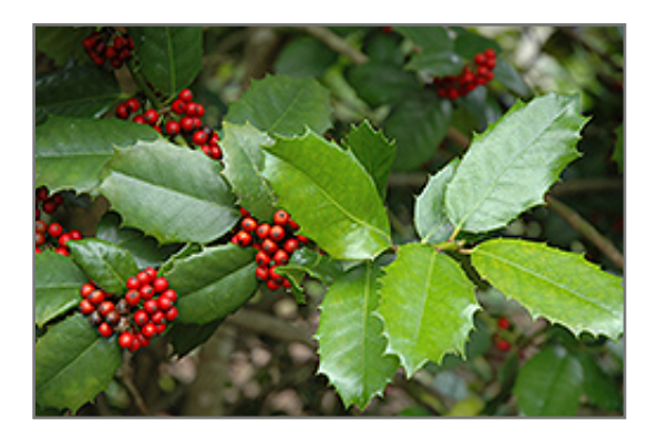
Emily Brunner Holly foliage