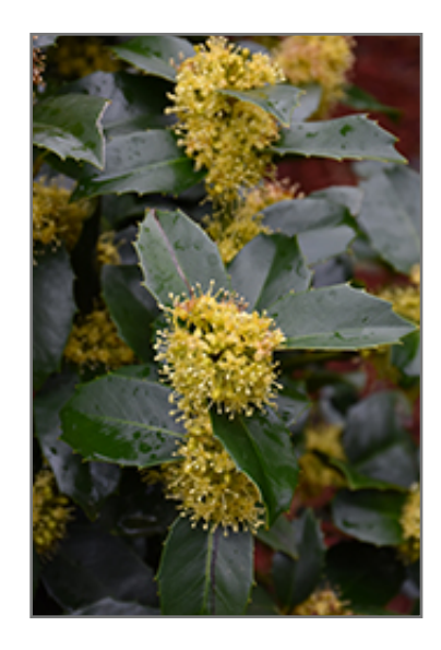
Emily Brunner Holly flowers

This tree does best in full sun to partial shade. It prefers to grow in moist to wet soil, and will even tolerate some standing water. It is particular about its soil conditions, with a strong preference for rich, acidic soils. It is quite intolerant of urban pollution, therefore inner city or urban streetside plantings are best avoided, and will benefit from being planted in a relatively sheltered location. Consider applying a thick mulch around the root zone in winter to protect it in exposed locations or colder microclimates. This particular variety is an interspecific hybrid.