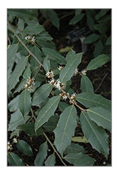
Himalayan Holly flowers

Himalayan Holly will grow to be about 25 feet tall at maturity, with a spread of 15 feet. It has a low canopy with a typical clearance of 2 feet from the ground, and is suitable for planting under power lines. It grows at a medium rate, and under ideal conditions can be expected to live for 50 years or more.