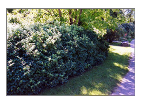
Clavey's Dwarf Honeysuckle

A medium sized ball-shaped shrub with dusty green foliage, small yellow flowers in spring and red berries in fall; excellent choice for use in groups or for hedges and screening because of its consistent shape; easy to grow and very adaptable