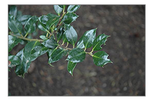
Rederly English Holly foliage

Rederly English Holly will grow to be about 25 feet tall at maturity, with a spread of 15 feet. It has a low canopy with a typical clearance of 2 feet from the ground, and is suitable for planting under power lines. It grows at a medium rate, and under ideal conditions can be expected to live for 50 years or more.