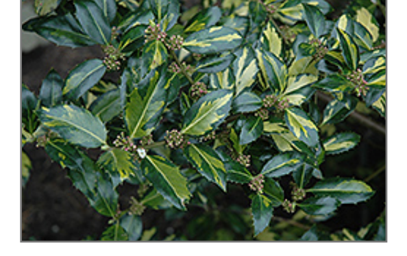
Silver Variegated English Holly foliage

Silver Variegated English Holly will grow to be about 30 feet tall at maturity, with a spread of 12 feet. It has a low canopy with a typical clearance of 2 feet from the ground, and should not be planted underneath power lines. It grows at a medium rate, and under ideal conditions can be expected to live for 50 years or more.