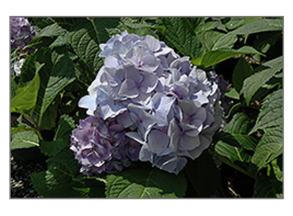
Penny Mac Hydrangea flowers

One of the more cold hardy varieties; clusters of blue or pink blooms, blue produced in acidic soil and pink in alkaline; flowers are abundant and dry well for arrangements; blooms on new wood so is suitable for colder areas to bloom reliably