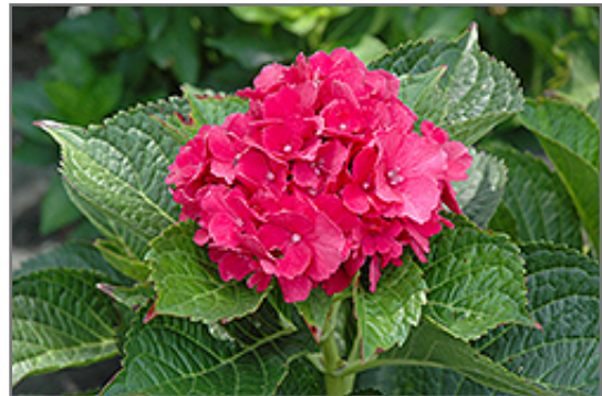
Masja Hydrangea flowers