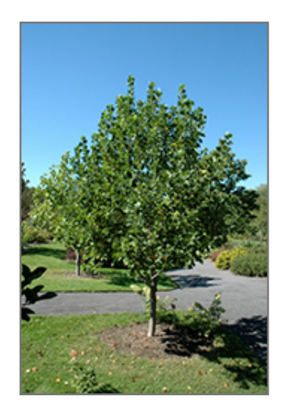
Ardis Tuliptree

This is a high maintenance tree that will require regular care and upkeep, and is best pruned in late winter once the threat of extreme cold has passed. Deer don't particularly care for this plant and will usually leave it alone in favor of tastier treats. Gardeners should be aware of the following characteristic(s) that may warrant special consideration;