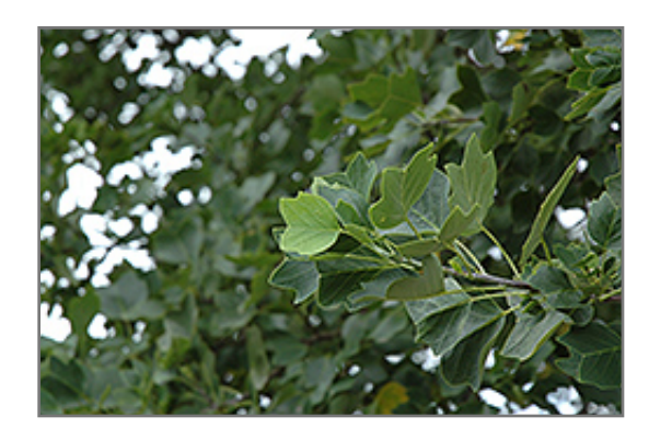
Ardis Tuliptree foliage