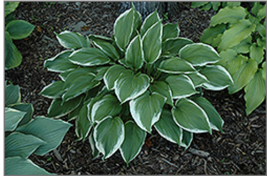
Zippity Do Dah Hosta