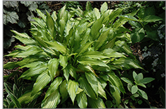
Yellow Splash Hosta