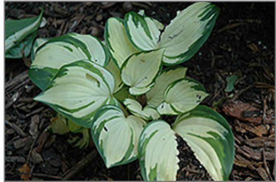
Warwick Delight Hosta foliage