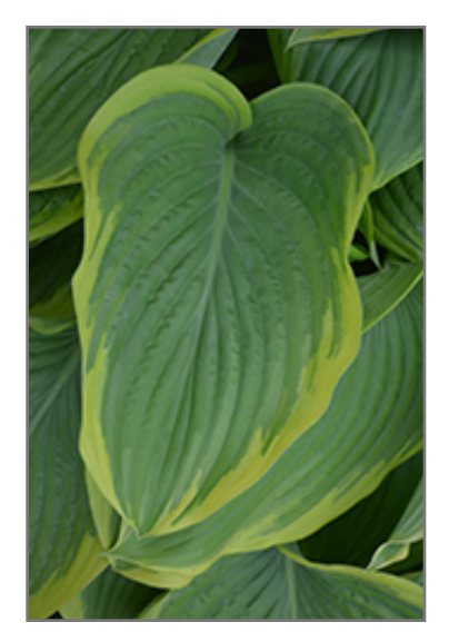
Victory Hosta foliage

Victory Hosta is a dense herbaceous perennial with tall flower stalks held atop a low mound of foliage. Its medium texture blends into the garden, but can always be balanced by a couple of finer or coarser plants for an effective composition.