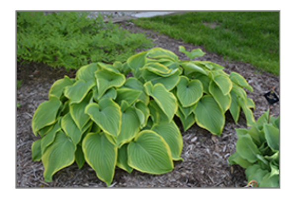
Victory Hosta

This is a relatively low maintenance plant, and is best cleaned up in early spring before it resumes active growth for the season. Gardeners should be aware of the following characteristic(s) that may warrant special consideration;