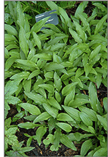
Tucker Wave Hosta foliage