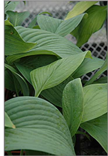
T-Rex Hosta foliage