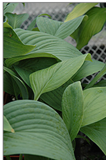
T-Rex Hosta foliage