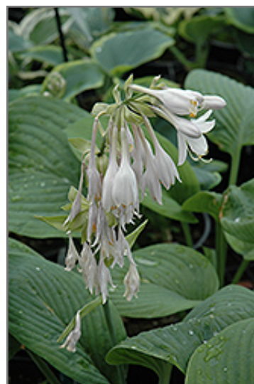
T-Rex Hosta flowers