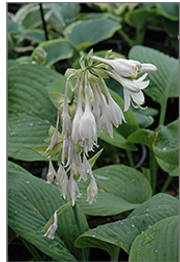
T-Rex Hosta flowers