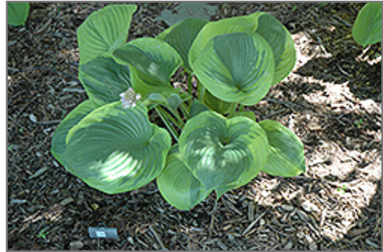
Titanic Hosta in bloom