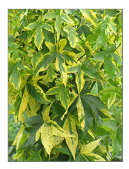
Variegated Sweet Gum foliage

Variegated Sweet Gum is recommended for the following landscape applications;