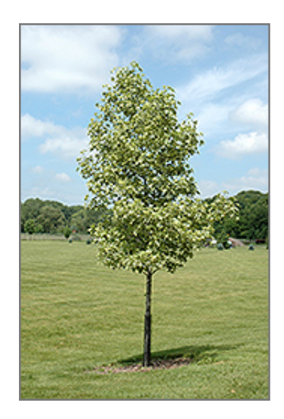
Variegated Sweet Gum