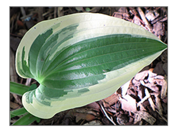
Shazaam Hosta foliage

Shazaam Hosta is a dense herbaceous perennial with tall flower stalks held atop a low mound of foliage. Its relatively fine texture sets it apart from other garden plants with less refined foliage.