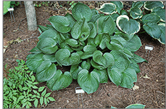
Second Wind Hosta