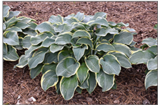
Regal Splendor Hosta

Regal Splendor Hosta is recommended for the following landscape applications;