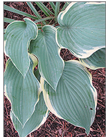
Regal Splendor Hosta foliage