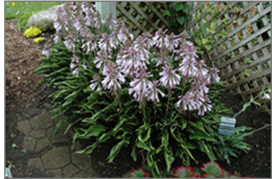
Praying Hands Hosta in bloom

Praying Hands Hosta is recommended for the following landscape applications;