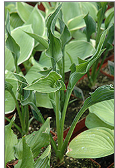
Praying Hands Hosta foliage