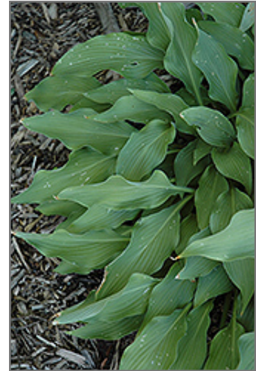
Pineapple Poll Hosta foliage