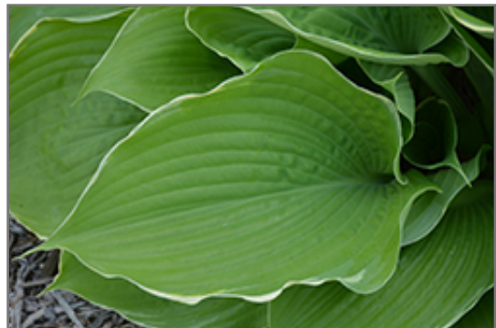
Parhelion Hosta foliage