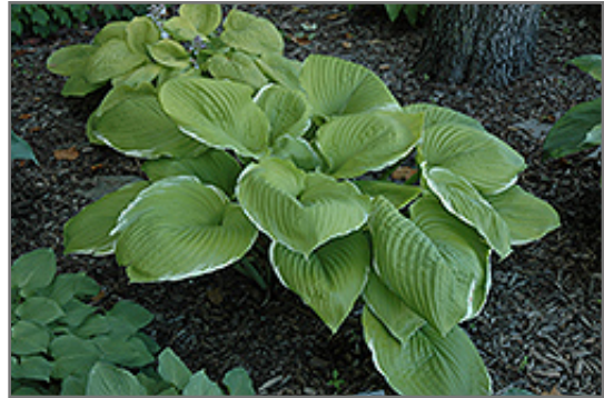
Parhelion Hosta

Parhelion Hosta is recommended for the following landscape applications;