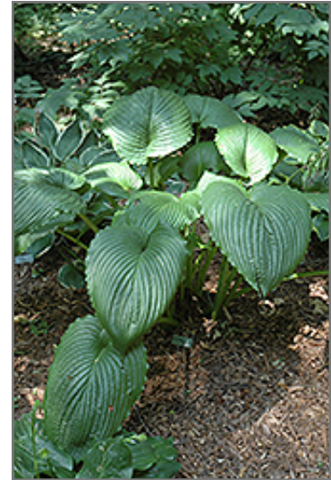
Niagara Falls Hosta foliage