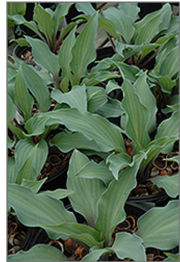
Miss Linda Smith Hosta foliage