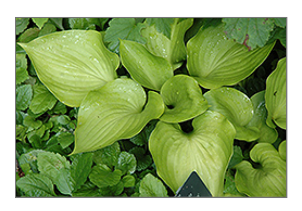
Maruba Iwa Hosta foliage