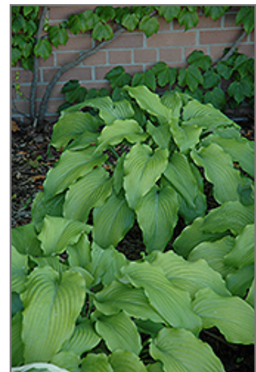
Lullabye Hosta