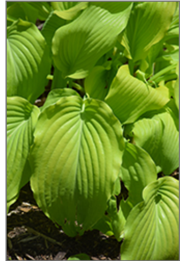
Lullabye Hosta foliage

Lullabye Hosta is recommended for the following landscape applications;