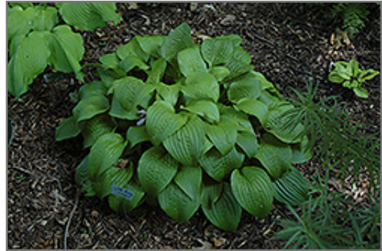
Little Black Scapes Hosta