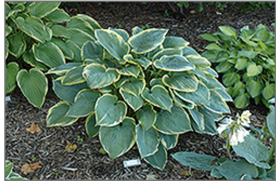
Lakeside Rhapsody Hosta

Lakeside Rhapsody Hosta is recommended for the following landscape applications;