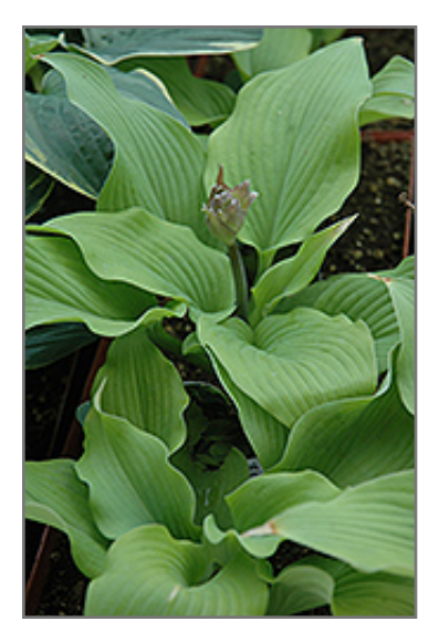
Jimmy Crack Corn Hosta foliage

An attractive bright variety with large deeply veined chartreuse foliage with an interesting pie crust edge; leaves that are held out horizontally provide beautiful texture and contrast to other plants; white spikes of flowers in early summer