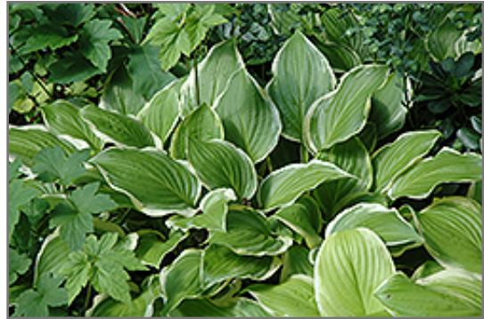
Iron Gate Glamour