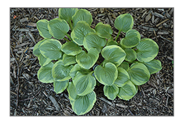
Ice Cream Hosta