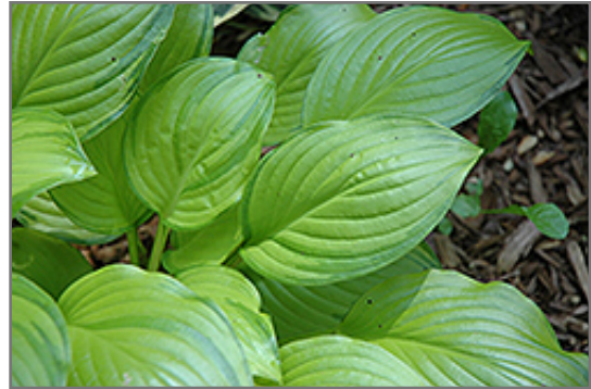
Hoosier Harmony Hosta foliage