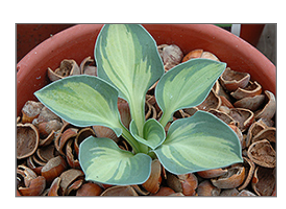
Holy Mouse Ears Hosta foliage

This variety features thick white leaves that are rounded and cupped, with uneven blue-green margins; light purple flowers appear on short scapes in mid-summer; provides beautiful texture and contrast to other plants