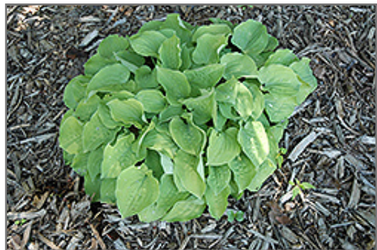
Heart Broken Hosta