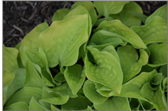
Heart Broken Hosta foliage

Heart Broken Hosta is recommended for the following landscape applications;