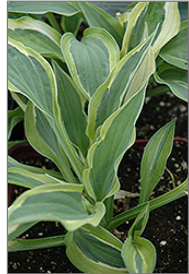
Hanky Panky Hosta foliage

Hanky Panky Hosta is recommended for the following landscape applications;