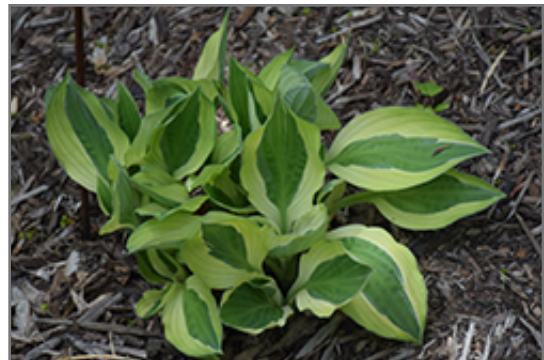
Hanky Panky Hosta