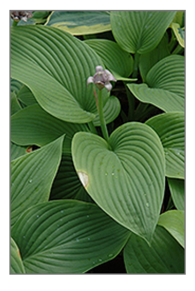
Green Acres Hosta foliage