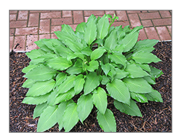
Green Acres Hosta