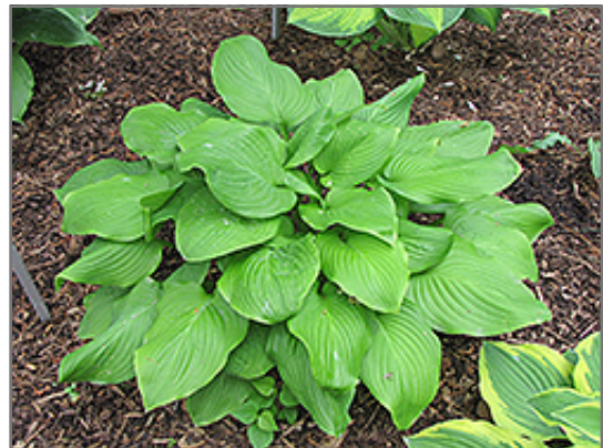
Fried Bananas Hosta