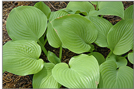
Fried Bananas Hosta foliage