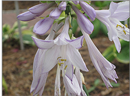
Fried Bananas Hosta flowers

Fried Bananas Hosta will grow to be about 24 inches tall at maturity extending to 3 feet tall with the flowers, with a spread of 4 feet. When grown in masses or used as a bedding plant, individual plants should be spaced approximately 4 feet apart. Its foliage tends to remain dense right to the ground, not requiring facer plants in front. It grows at a fast rate, and under ideal conditions can be expected to live for approximately 10 years. As an herbaceous perennial, this plant will usually die back to the crown each winter, and will regrow from the base each spring. Be careful not to disturb the crown in late winter when it may not be readily seen!