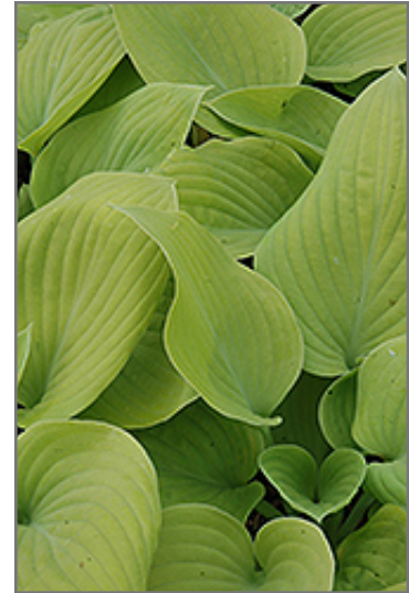
Fat Cat Hosta foliage