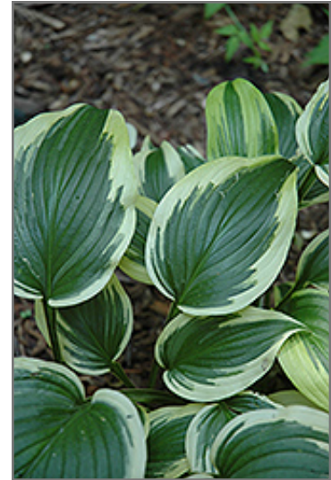
Fantabulous Hosta foliage