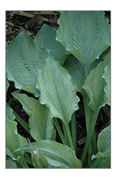
Fallen Angel Hosta foliage

This interesting hosta has leaves that emerge light green then turn blue-green and finally green in late summer; provides beautiful texture and contrast to other plants; cream spikes of flowers in mid-summer rise over this ever changing foliage