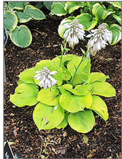
Faith Hosta

Faith Hosta is recommended for the following landscape applications;