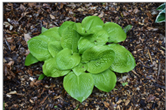
Faith Hosta