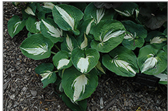
Dream Queen Hosta