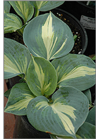
Dream Queen Hosta foliage