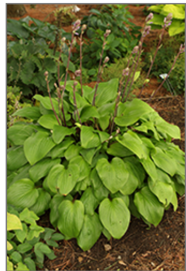
Designer Genes Hosta