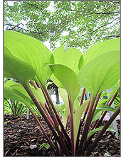
Designer Genes Hosta foliage