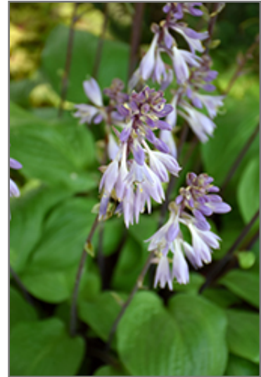
Designer Genes Hosta flowers

Designer Genes Hosta will grow to be about 18 inches tall at maturity extending to 24 inches tall with the flowers, with a spread of 18 inches. When grown in masses or used as a bedding plant, individual plants should be spaced approximately 15 inches apart. Its foliage tends to remain dense right to the ground, not requiring facer plants in front. It grows at a slow rate, and under ideal conditions can be expected to live for approximately 10 years. As an herbaceous perennial, this plant will usually die back to the crown each winter, and will regrow from the base each spring. Be careful not to disturb the crown in late winter when it may not be readily seen!