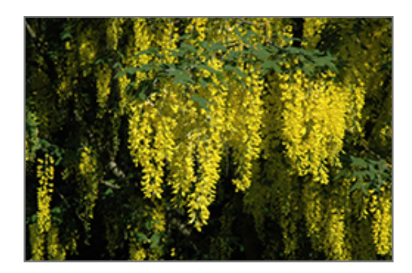
Vossii Laburnum flowers