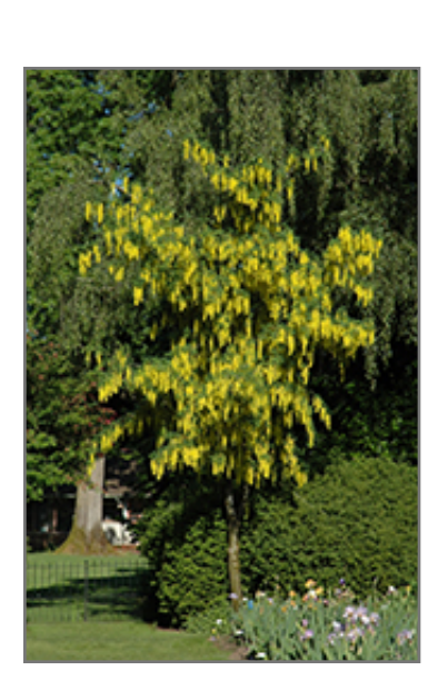
Vossii Laburnum in bloom

This is a relatively low maintenance tree, and should only be pruned after flowering to avoid removing any of the current season's flowers. It is a good choice for attracting hummingbirds to your yard. Gardeners should be aware of the following characteristic(s) that may warrant special consideration;