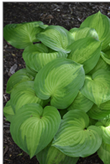
Dance With Me Hosta