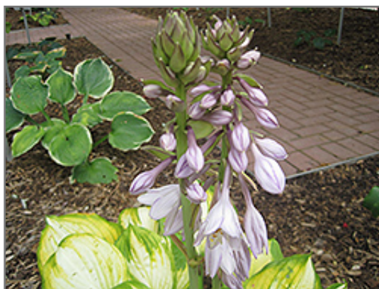
Dance With Me Hosta