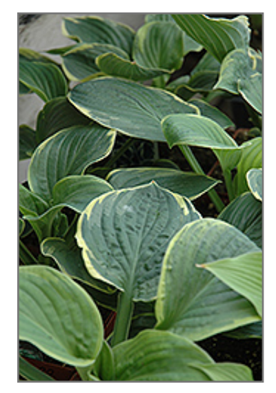
Christmas Tree Hosta foliage

Unique variety with large rounded and cupped leaves that are dark green with a creamy white edge; nice substance and is heavily crinkled; white spikes of flowers in summer with vestigial leaves in the shape of a christmas tree